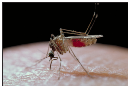
Figure 4. Adult C. tarsalis .