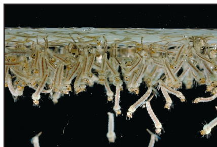
Figure 2. Larvae of C. tarsalis .