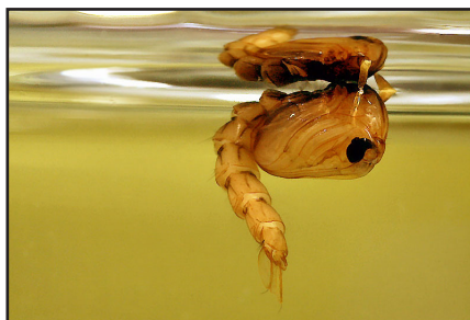
Figure 3. Pupal stage.