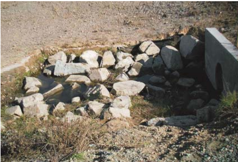
Figure 3. The use of loose rocks (riprap) to dissipate the energy of incoming runoff encourages mosquito production. Inevitably, standing water collects between the rocks, providing habitat for mosquitoes and making monitoring and control very difficult. A low-maintenance sloped concrete slab with imbedded rocks or concrete blocks is recommended as an alternative.